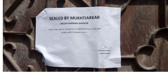
Baldia Town, Karachi

orders of Justice Tariq Saleem Sheikh of the LHC vi , which stated that Ahmadi worship places built before 1984 require no amendments. The mosque in Jahman was completed in 1971. Furthermore, the landmark decision by Justice Tassaduq Hussain Jilani in 2014 vii , which called for the establishment of a Special Task Force to protect worship places, is being ignored as police instead appease societal elements that undermine Pakistan's integrity.