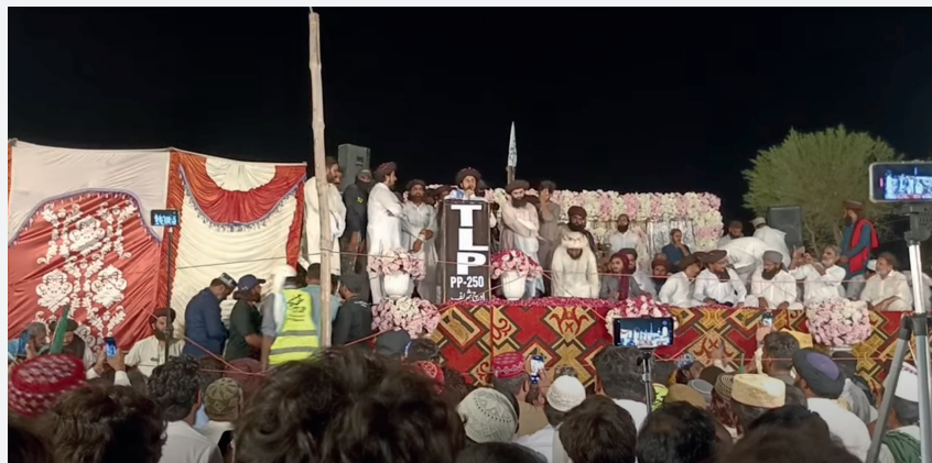
Basti Shikrani, District Bahawalpur; September 17, 2023:

For quite some time now, the situation has been tense for the Ahmadiyya community here. The anti-Ahmadiyya activities of opponents have spiked. Apart from hate-provoking posters and processions, different religious organizations frequently organize Khatme Nanuwwat conferences.