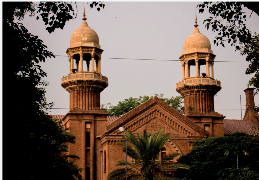
Lahore, October 2023:

It is significant that while there has been a multitude of attacks on Ahmadiyya places of worship and graves in recent years, this year has witnessed a quantum jump in such violations. More than 39 Ahmadiyya worship places and over a hundred graves have suffered attacks this year alone.