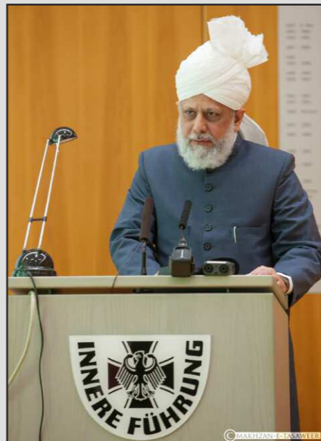
Hadhrat Mirza Masroor Ahmad (Head of the worldwide Ahmadiyya Muslim community)

The community stands at one with the Khalifa in the remembrance of God and service of mankind.