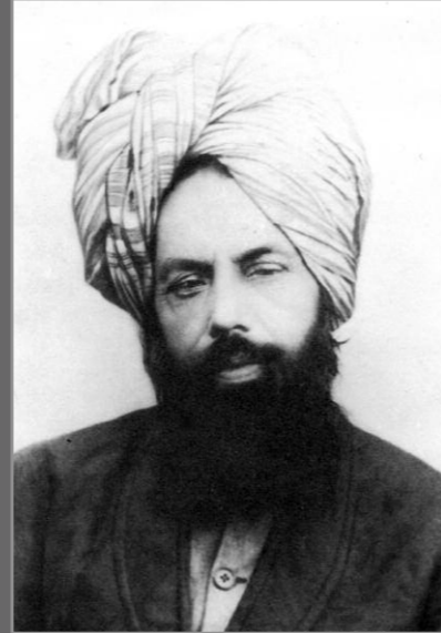
Hadhrat Mirza Ghulam Ahmad (The Promised Messiah & Mahdi) (peace be upon him)

The UK chapter of the community was established in 1913 and in 1924 it built London's first purpose built mosque (in Putney). It is therefore one of the oldest and most established Muslim organisations in Britain and now has more than 90 branches across Britain.