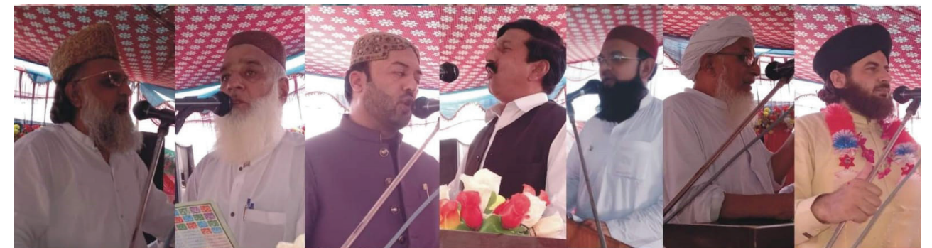
Some speakers at the conference.