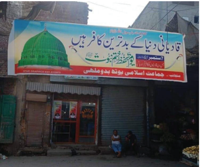
Panaflexe installed in Baddomalhi