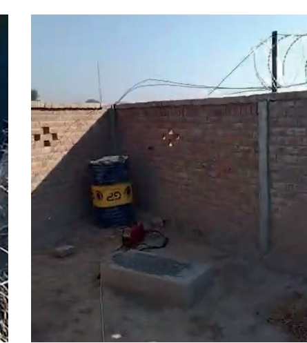
Tombstone of a minor girl removed