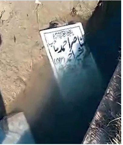
Tombstones thrown outside

Unidentified miscreants tore down three forced by their Islamiyat teacher to take Ethics instead Ahmadiyya gravestones at midnight. Police were of Islamiyat because of their Ahmadi faith. informed about the incident.