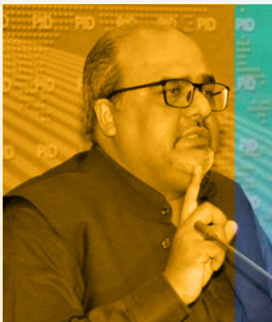
Shahzad Akbar (Advisor to the Prime Minister)

The FIR has been registered under sections 506 (punishment for criminal intimidation), 189 (threat of injury to public servant), 298 (making statements with deliberate intent to wound religious feelings) and 153 (provoking to cause riot) of the Pakistan Penal Code.