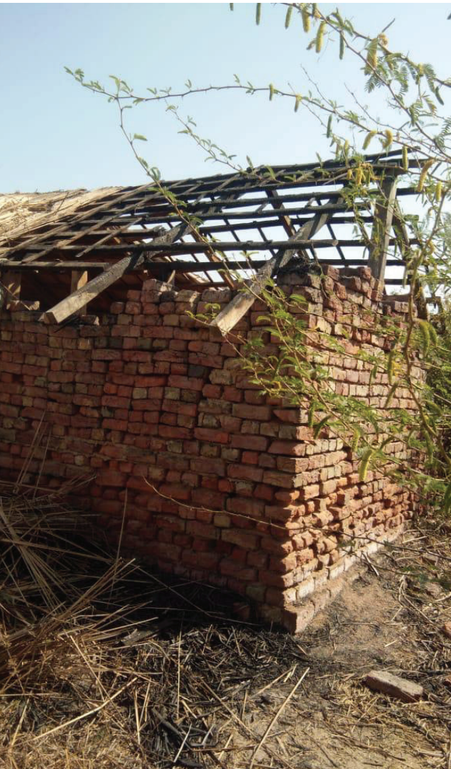
Ahmadiyya Mosque Goth Ali Murad, Badin , Sindh

On January 23, another incident took place here. A day before the wedding of an Ahmadi girl, the wedding tents were torn open by unknown persons with a blade at midnight and set on fire. The Ahmadi family had to pay the cost of the damage to tents.