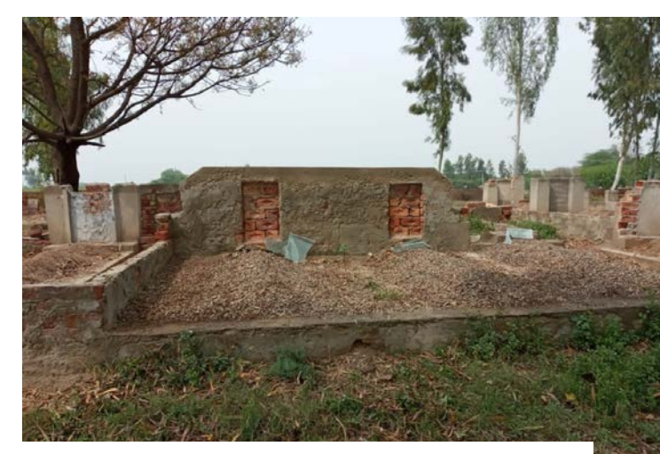
Sixteen Ahmadis' gravestones destroyed by the police in Kot Diyaldas, District Nankana