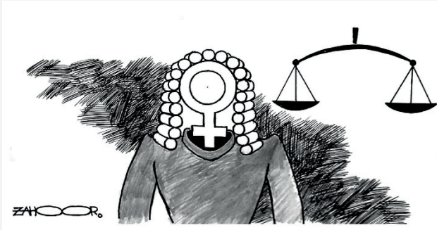
Published in daily Dawn on January 26, 2022