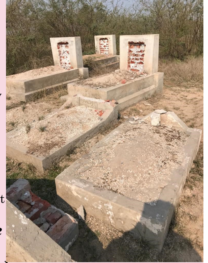
Gravestones desecrated by police in Chak 565 GB, Jaranwala, District Faisalabad

So, on February 3, after sunset, the police arrived accompanied by some local non-Ahmadis. They tore down 25 tombstones and took these away with them.