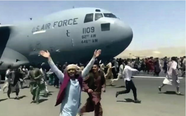
Desperate Afghans clinging to US plane amid chaotic scenes at Kabul airport

should decide to put an end, through constitutional provisions, to the culture that supports torture in the criminal justice system, so that human rights activists and journalists are spared state tyranny. Press Release of HRCP on July 13, 2021