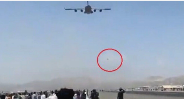
A man falling from a plane who tried to stow away in the undercarriage of an aircraft