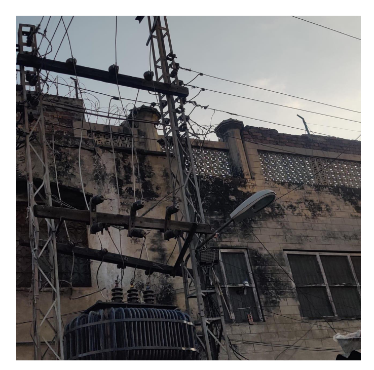
Demolished minarets at an Ahmadiyya site of worship in Moti Bazaar, Wazirabad